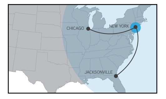
New York to Chicago 643 nautical miles

New York to Jacksonville 790 nautical miles